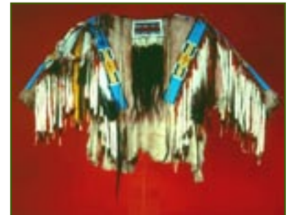
A Nez Perce beaded shirt