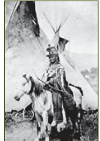
Looking Glass, leader of the Nez Perce in front of a tipi 1877

The Nez Perce were known for their riding ability and fast horses. They also are skillful fishermen.